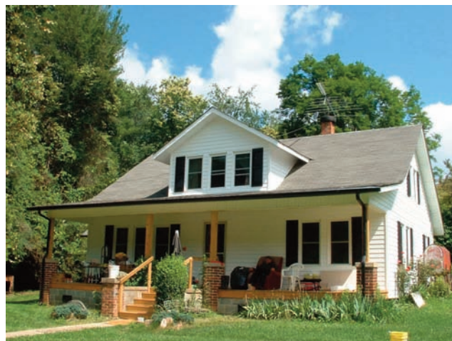
Left: House in Alleghany County receiving rehabilitation assistance through the CDBG Scattered Site Program. Right: Completed rehabilitation.

Scattered Site Housing Program is a non-competitive program offered by the NC Division of Community Assistance (DCA). Every three years each county throughout the state receives $400,000 to provide housing rehabilitation assistance to low-income homeowners. Typically applications announcements are made by DCA in mid-summer, with applications due to in the fall.